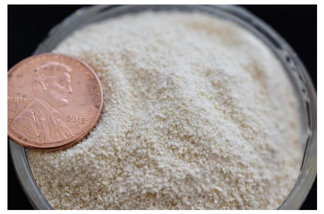
Ashland polyclar<sup>™</sup> brewbrite granules

FOR FURTHER INFORMATION: Media Relations Nina Servino janina.servino@ashland.com 302-518-0104