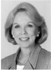
Bernadine P. Healy, M.D.