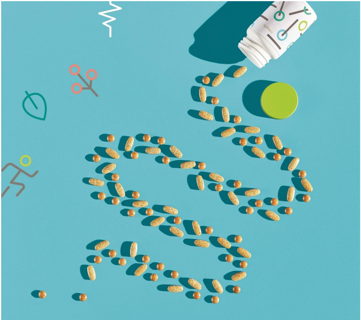
GPM™ fermented nutrients