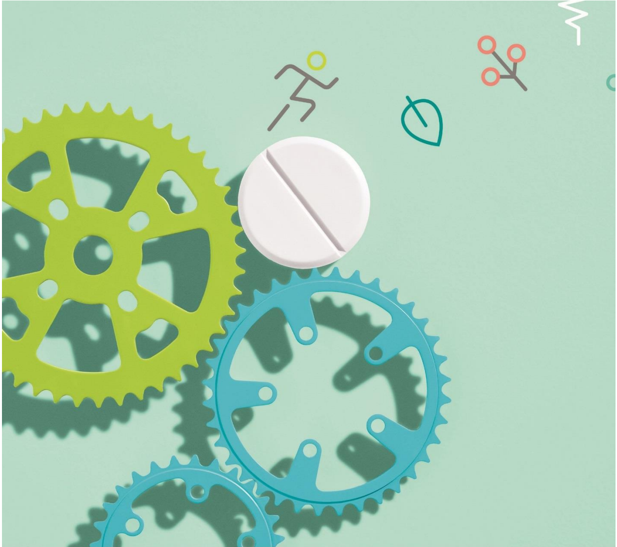
Klucel Nutra™ U