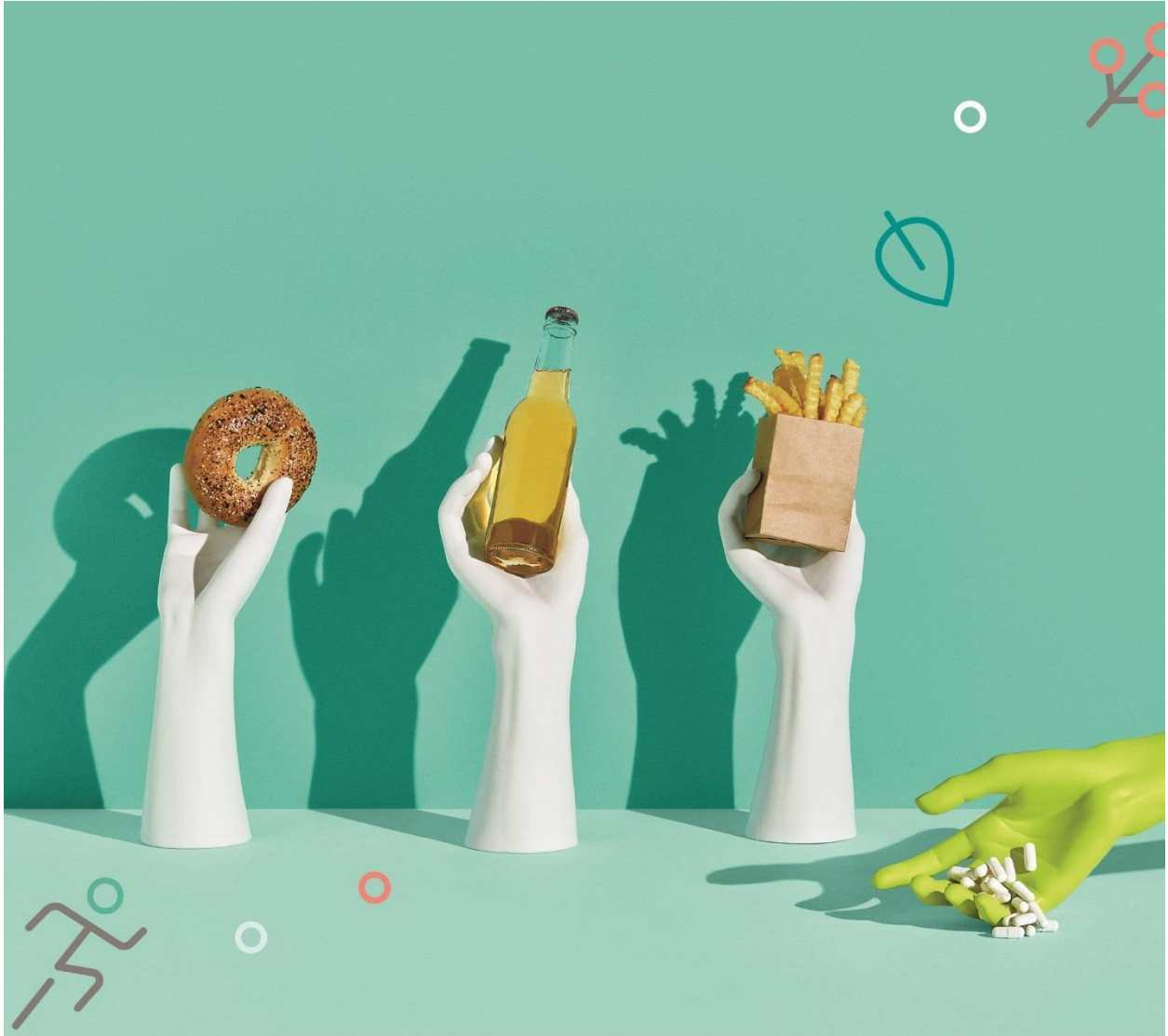
Phase 2™ carb blocker