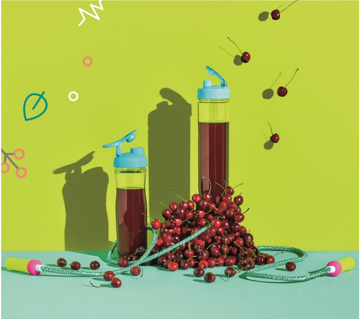
NordicCherry® tart cherry extract